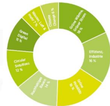
research landscape

The Green Tech research institutions in Styria and Carinthia are driving the green transformation with their know-how in the sectors of renewable energies and the circular economy. At 18%, their